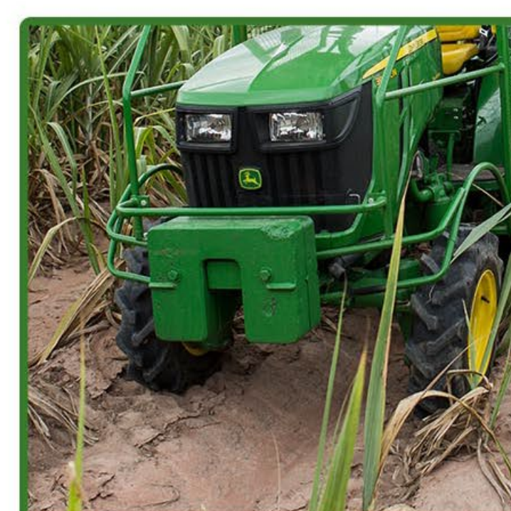
Narrow Track Width