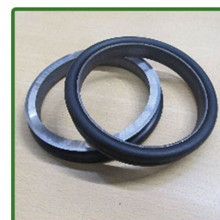
Metal Face Seals