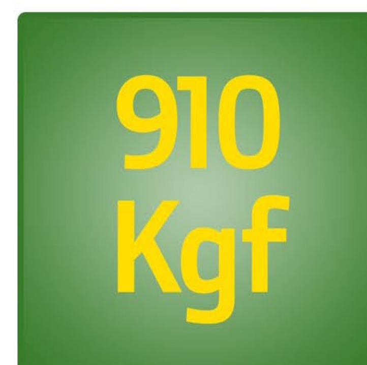
Best In Class Lift Capacity